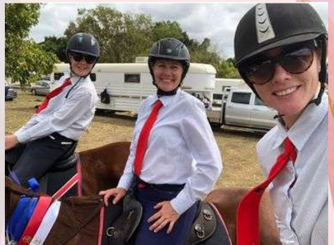
Daughter, mother, daughter - and all with the same smile. Mackay and District PC, August 2020.