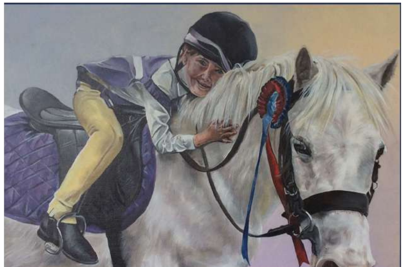
Examples of previous Pony Club UK art competition winners